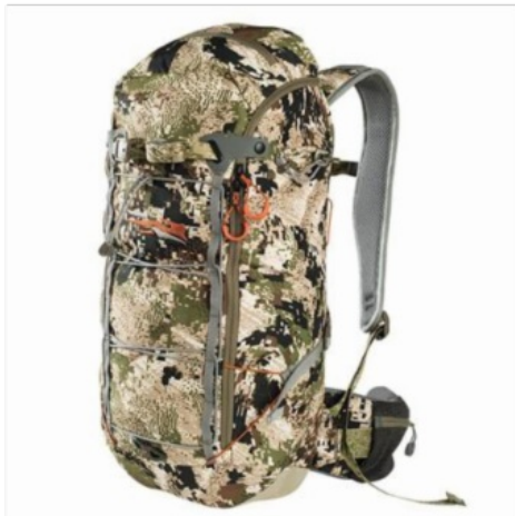
Sitka Ascent Pack

Only 100 tickets will be sold at $10 each