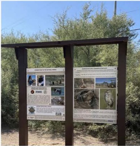
Photo of kiosk with AZSFWC recognition