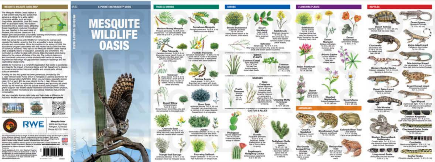
Photo of field guide with AZSFWC recognition

Thanks to AZSFWC, 3,000 laminated field guides were provided to Wildlife for Tomorrow for distribution to students visiting Mesquite Wildlife Oasis. These guides are designed for students to take home and use long after their visit, extending the educational impact of the program beyond the day's experience. The species featured are common to Arizona's desert landscapes, giving students the opportunity to continue using the guides throughout their outdoor learning journey.