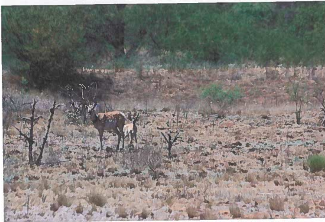
Doe with fawn