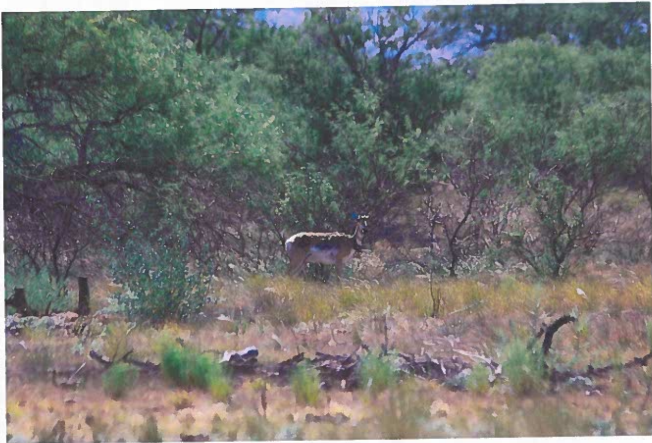
Doe with Collar, Photo by Vivian Current