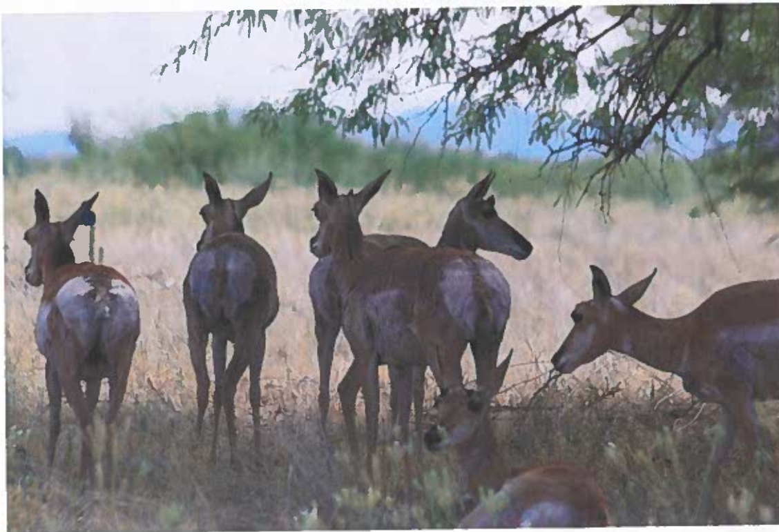
Doe Group