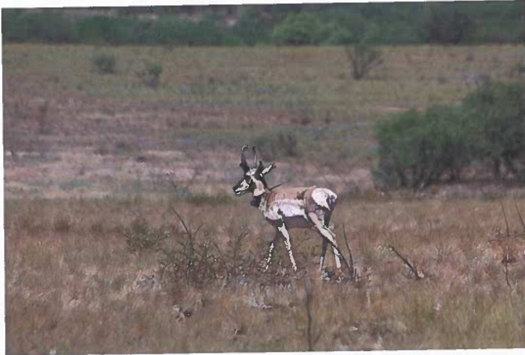
Buck with collar

Please return this completed form and supporting documentation and send along with photos to: AZ Sportsmen for Wildlife Conservation Grant Program PO Box 75731 New River, AZ 85087 or e-mail to info@azsfwc.org . Phone: 602-361-6478.