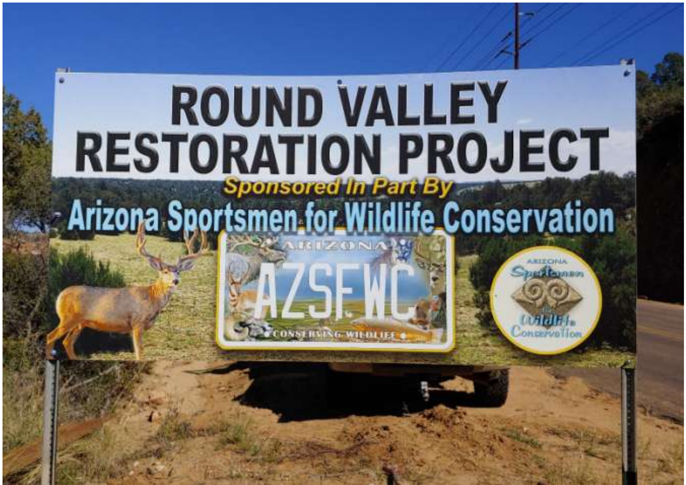
Partnership sign at the entrance to the community of Round Valley