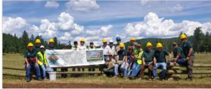
MUTS crews also conducted a trash pickup in the area, gathering up a lot of things "left behind", including a recliner.

MUTS Website-Event Photo Page continued , with links on the AZSFWC and license plate logos: