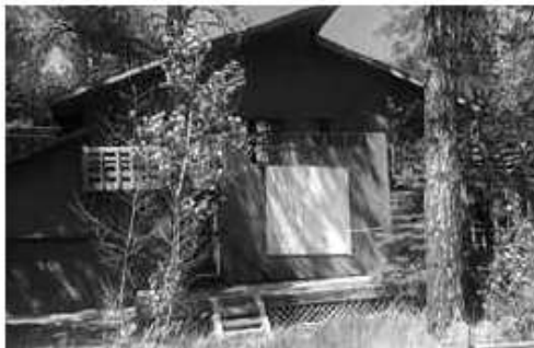
THIS ABANDONED HOUSE ON PINEWOOD BLVD. IS ALL BOARDED UP!

Finally, Coconino County Community Development takes NOTICE!!! Abandoned property on Pinewood Blvd. The Notice says: IT HAS COME TO OUR ATTENTION THAT THE FOLLOWING VIOLATION(S) OF COUNTY ORDINANCES, CODE AND/OR STATE STATUTES EXIST ON PROPERTY: Reason: Unsecure Building Notice of Violation has been sent to Owner on 5/7/19 FAILURE TO RESPOND WITHIN 5 DAYS COULD RESULT IN CIVIL SANCTIONS & PENALTIES