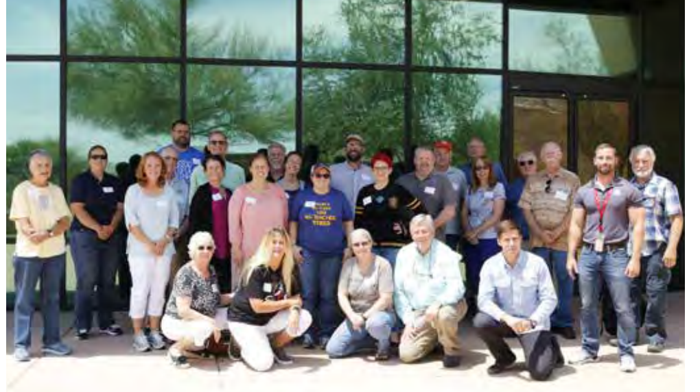
A Trout In the Classroom workshop was held in August 2019 in Phoenix.

"In the program, students use STREAM [science, technology, rec-