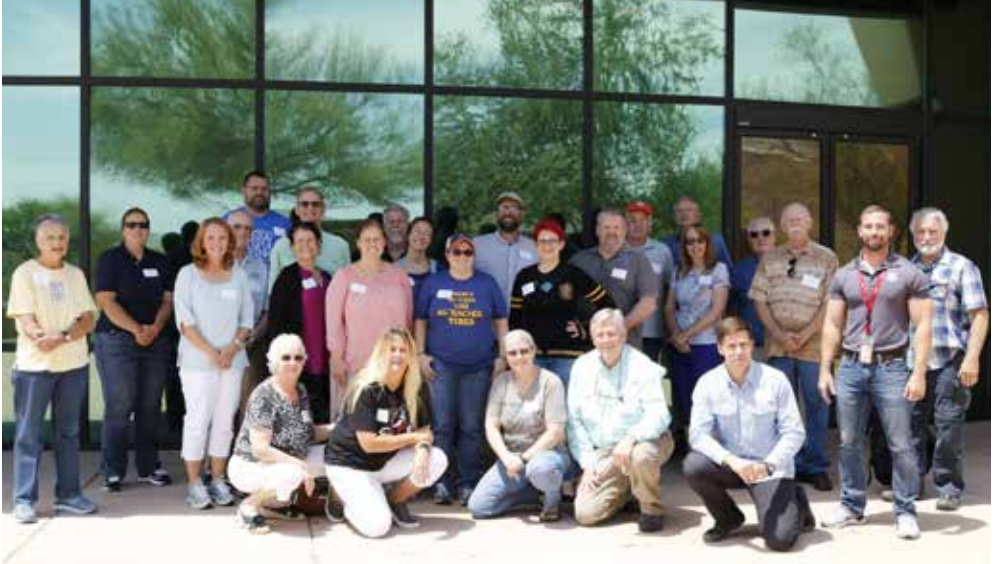
A Trout In the Classroom workshop was held in August 2019 in Phoenix

"In the program, students use STREAM [science, technology, rec-