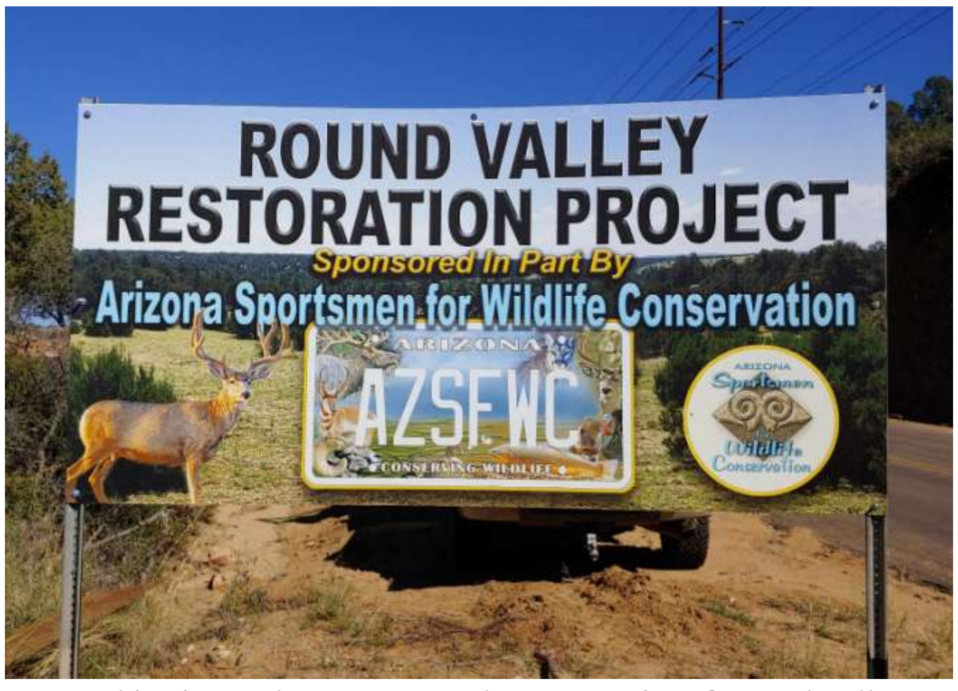
Partnership sign at the entrance to the community of Round Valley