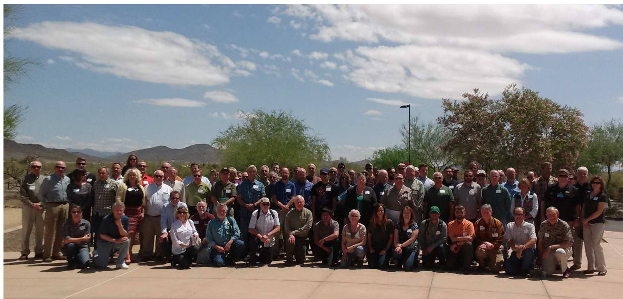
6 th Annual Native Trout Conference Attendees April 23, 2015

The agenda and presentations are available to the public and can be viewed on the Trout Unlimited Arizona Council website at www.az-tu.org .