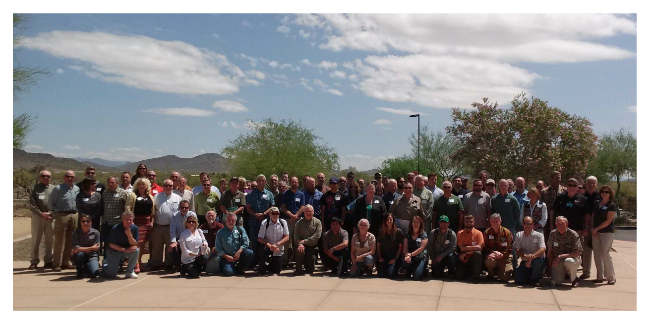
6<sup>th</sup> Annual Native Trout Conference Attendees April 23, 2015

The agenda and presentations are available to the public and can be viewed on the Trout Unlimited Arizona Council website at <a href="https://www.az-tu.org">www.az-tu.org</a>.