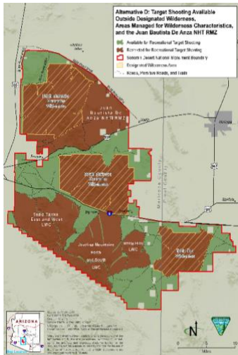
BLM Alternative D

Alternative C – the BLM’s preferred alternative would allow target shooting in the Desert Back Country Recreation Management Zone only and partially lift the court order closure as addressed in Alternative B. The effect is that 54,817 acres or 11% of the SDNM would be closed to target shooting.