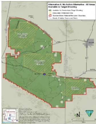
BLM Alternative A

Currently, the nearly 500,000-acre Sonoran Desert National Monument is open to target shooting, with the exception of 10,599 acres temporarily closed by a court order in a lawsuit filed against an earlier BLM plan that would have kept the entire SDNM open to shooting. The court order also requires the BLM to complete the management plan by September 2017. The draft plan presents five alternatives as follows: