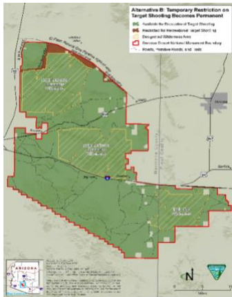
BLM Alternative B

Alternative A - the "no action" alternative continues the 1988 Lower Gila South Resource Management Plan without change, which means that target shooting would be allowed anywhere within the SDNM.