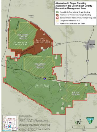
BLM Alternative C

Alternative C – the BLM’s preferred alternative would allow target shooting in the Desert Back Country Recreation Management Zone only and partially lift the court order closure as addressed in Alternative B. The effect is that 54,817 acres or 11% of the SDNM would be closed to target shooting.